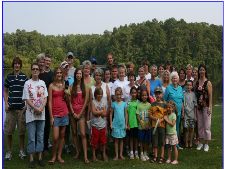
FHF Members at Sesquicentennial Park in Columbia.