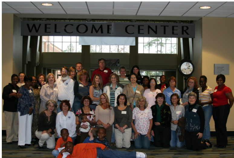
FHF members (31 adults and 7 children) attend a "Coping 'With Grief During the Holidays'" workshop held in November at Shandon Baptist Church in Columbia.