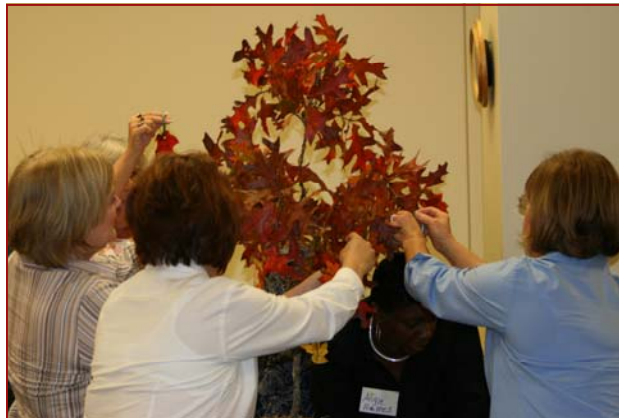
Members hang ornaments on a “memory” tree at the 2008 workshop.